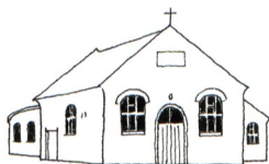
St Teresa's R.C. Church, Fishers Lane

Sunday Mass 11 am St Teresa's & 9am St Kenelm's, Ch Enstone Daily Mass: 9.30 St Teresa's with Morning Prayer 9.15 am Holydays Mass at 9.30 am and 7.30 pm