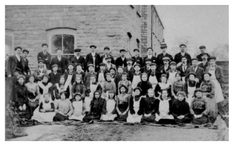
Staff of Fownes Ltd, glove makers. The factory was off the Ditchley Road, later used as the Youth Hostel.

New stewards are always welcome to help staff the museum when it is open. Do think about joining us next year. If you are interested, please contact charlburymuseum@elmstead.plus.com