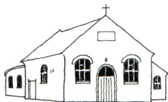
St Teresa's R.C. Church, Fishers Lane