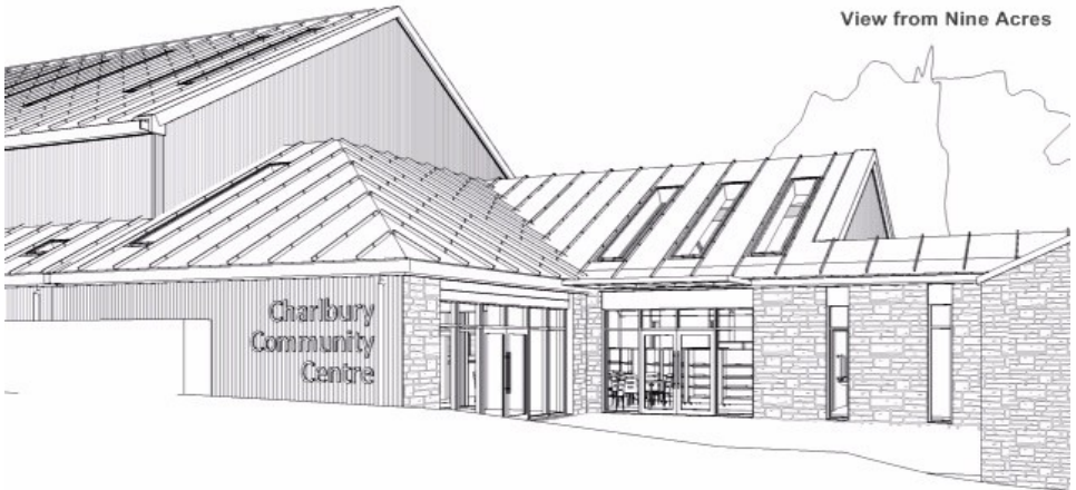
View from Nine Acres

It's the final countdown to starting work in 2016 on our smart new community centre. We hope everyone will have a sense of connection with the project as the building takes shape in the heart of our vibrant town.