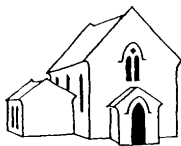
Charlbury Baptist Church

Contact: Secretary 810107 charlburybaptistchurch@gmail.com