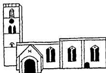
St Mary's C of E Church

Full details of all services in Church porch or see The Leaflet