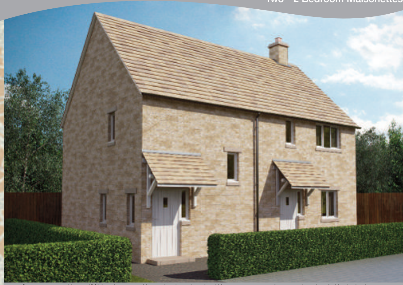
Computer generated images (CGI) have been created from an imaginary viewpoint within an open space area. Its purpose is to give a feel for the development, not an accurate description of each property. The CGI shows a typical Soha Housing Limited house of this type, but there may be variances from site to site. External materials, finishes, landscaping may vary throughout the development. Homes may also be built handed (mirror image). Please enquire for further details.