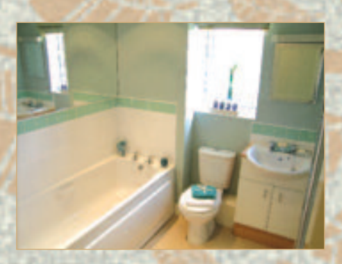
Images of a typical Soha home. Finishes may vary from those shown, due to our policy of continuous development.