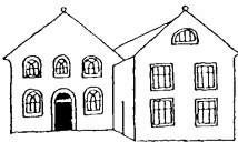
Methodist Chapel, Fishers Lane

Morning Service normally Sundays at 10.30 am, any changes will be posted on church notice board. Holy Communion March 20th (Palm Sunday), April 17th and May 8th