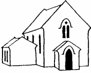
Baptist Chapel, Dyers Hill

Easter Day: Joint Service at the Methodist Church 10.30 am