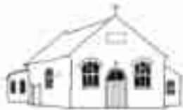
St Teresa's R.C. Church, Fishers Lane

Palm Sunday March 20: Holy Mass & Blessing of Palms at 11 am (9.30 am at Enstone Youth Hall)